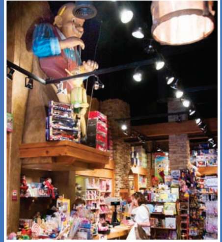
Best Toy Store: Geppetto's For three decades, Geppetto's has sparked imaginations and creativity with classic toys, from darling dolls to smart science kits, board games to bikes. The familyowned, countywide chain — eight stores in total — truly is "a child's fantasy." (www.geppettostoys.com)